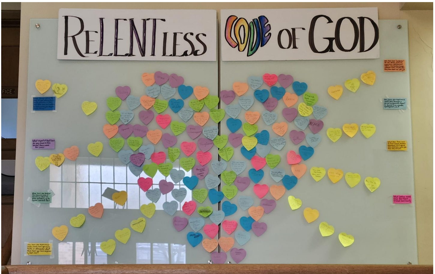
"The ReLENTless Love of God" sermon series heart wall created by the congregation throughout Lent, Spring 2024 To read the sermon reflection responses on each heart, click here

We welcome all who are seeking God's love and grace. We welcome all because God welcomes all, regardless of race or culture, sexual orientation, gender identity, or relationship status. We welcome all without regard to addictions, physical or mental health, imprisonment, socio-economic circumstances, or anything that too often divides us. Our unity is in Christ.