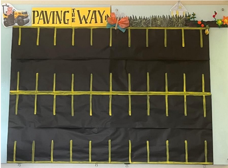
Completed Paving the Way intent tracker Spring 2024