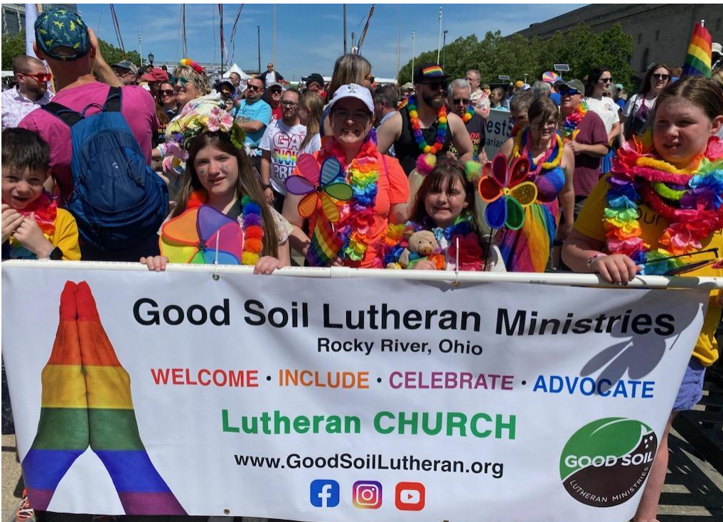
Good Soil marching in the Cleveland Pride Parade, June 2024