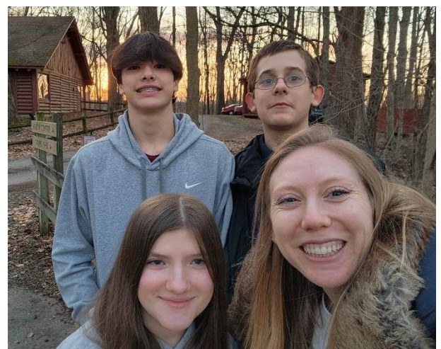
Confirmation Camp at Hopewood Pines, Mar 2024