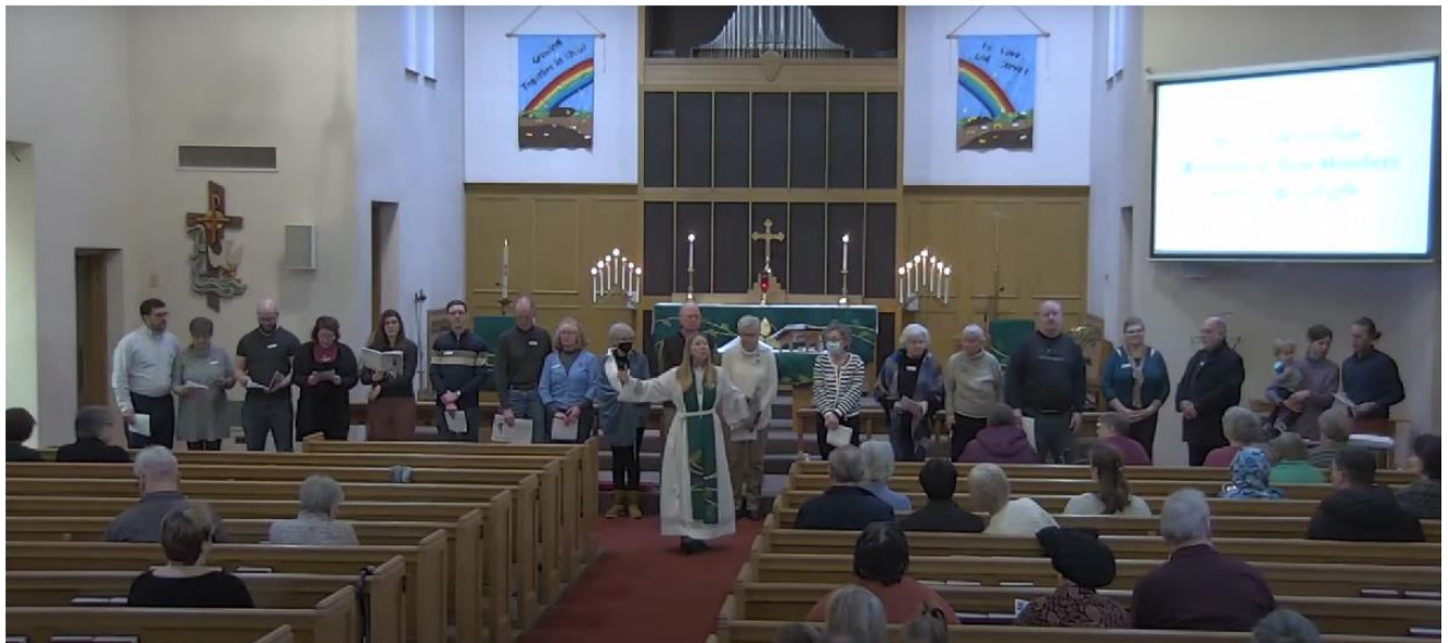
Celebrating Welcome of New Members , January 28, 2024

Numbers reflected here account for membership changes due to transfers in and out, baptisms, deaths, and welcome of new members.