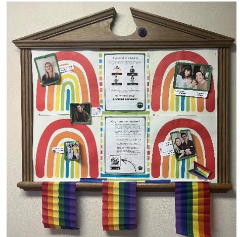
Good Soil pronoun board

We started the year with a productive first meeting, filled with meaningful discussions and strategic planning for the months ahead.