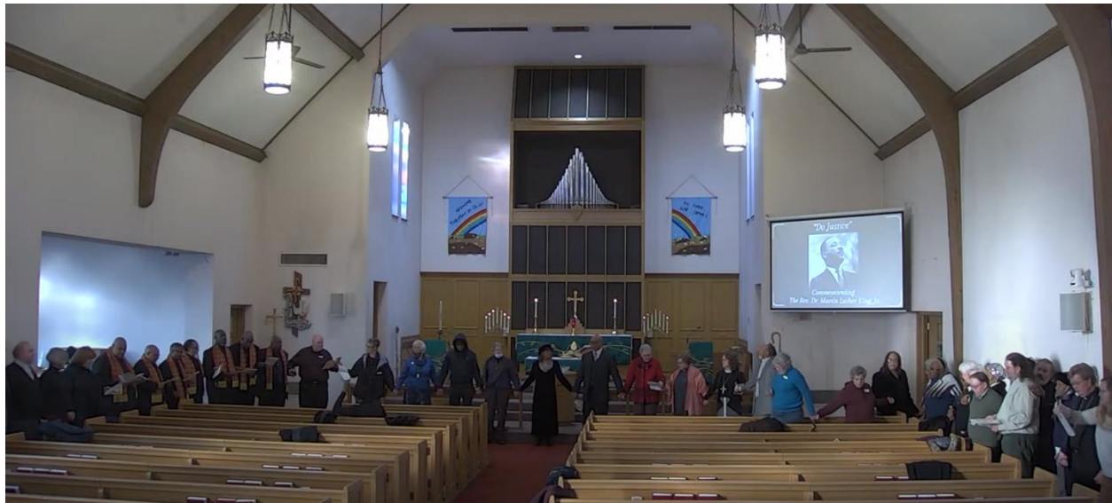
Great shot captured by the livestream from the MLK Commemoration Service, January 2024