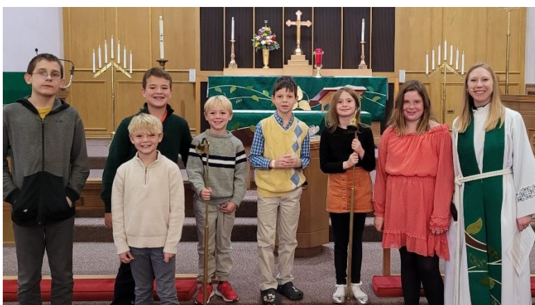
Acolyte Training, Oct 2023